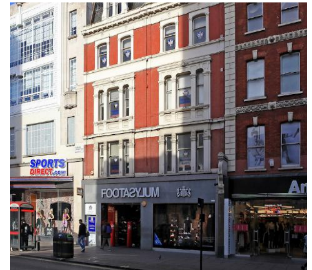
146-148 Oxford Street Class E 3,355 sq ft Ground Floor, Bse Sales & Vaults Rent £POA