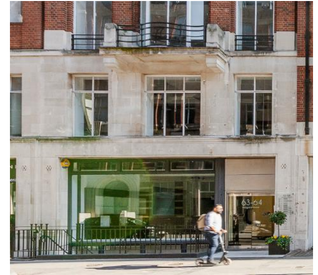
63-64 Margaret Street Showroom 2,000 sq ft NEW INSTRUCTION Ground Floor & Basement Rent £110,000 pa