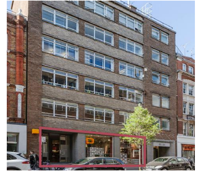
23-25 Eastcastle Street Showroom 5,780 sq ft NEW INSTRUCTION Ground & Basement Floor Rent £POA