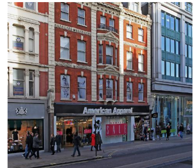
142-144 Oxford Street Class E 5,045 sq ft Basement, Ground & First Floors Rent £POA