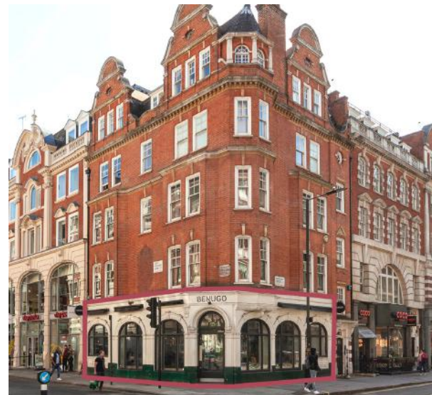
23-25 Great Portland St Class E 2,170 sq ft UNDER OFFER Ground Floor & Basement Rent £POA