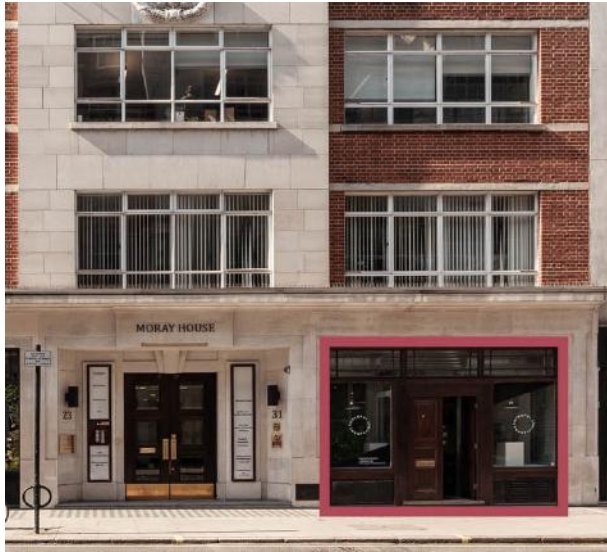
Moray House, 23-35 Great T St Class E 1,880 sq ft NEW INSTRUCTION Ground Floor & Basement Rent £POA