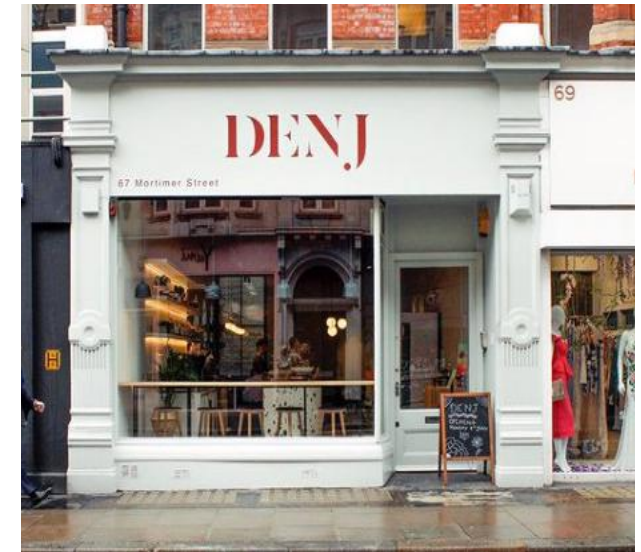
67 Mortimer Street Class E 1,330 sq ft UNDER OFFER Ground Floor & Basement (East) Rent £85,000 pa