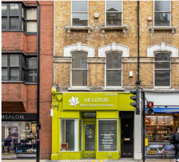
51 Great Portland St Class E 750 sq ft UNDER OFFER Ground Floor & Basement Rent £45,000 pa