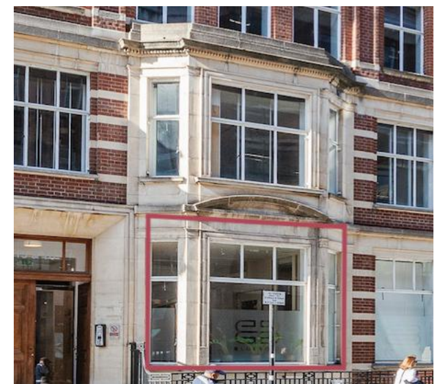
15-16 Margaret Street Class E 2,300 sq ft NEW INSTRUCTION Ground Floor Rent £POA