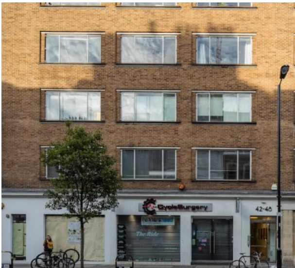
42-48 Great Portland St Class E 3,700 sq ft UNDER OFFER Ground Floor & Basement Rent £165,500 pa