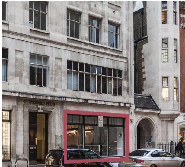
Great Titchfield House, 14-18 Great Titchfield St Showroom 2,110 sq ft UNDER OFFER Ground Floor & Basement (East) Rent £110,000 pa