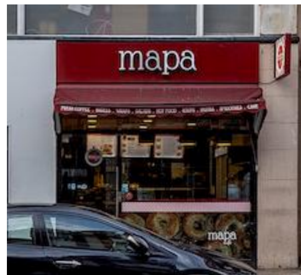
20 Great Portland Street Class E 655 sq ft Ground Floor (Front) Rent £52,000 pa