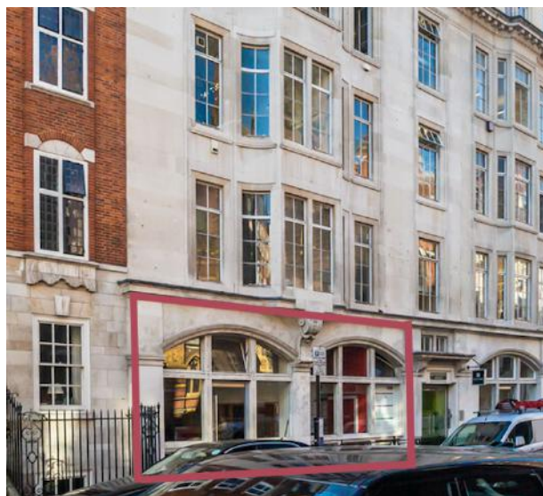
Kenilworth House, 79-80 Margaret Street Class F1 1,500 sq ft Basement Rent £58,500 pa