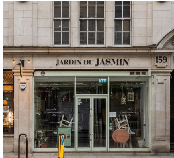
161 Great Portland Street Class E 1,030 sq ft Ground Floor & Basement Rent £85,000 pa