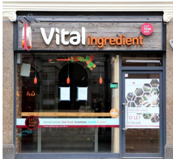
48 Margaret Street Class E 1,750 sq ft UNDER OFFER Ground Floor Rent £130,000 pa