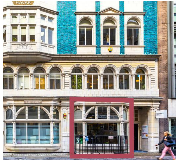
Radiant House, 34-38 Mortimer Street Showroom 2,700 sq ft Ground Floor & Basement Rent £120,000 pa