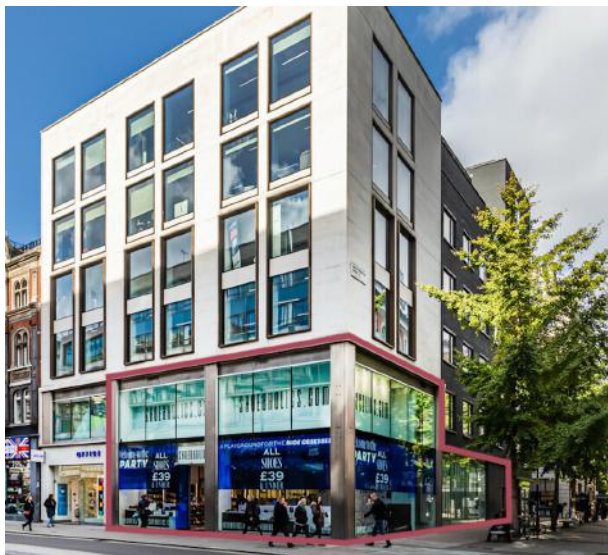
184-188 Oxford Street Class E 5,780 sq ft Ground, Basement & First Floor Rent £POA