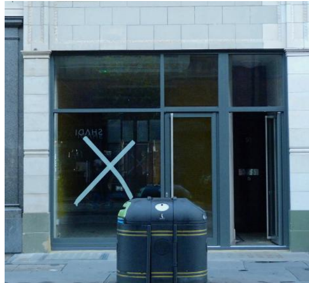
50 Great Portland St Class E 1,310 sq ft SHELL & CORE Ground Floor & Basement. Rent £65,000 pa