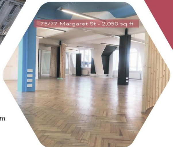
75/77 Margaret St - 2,050 sq ft